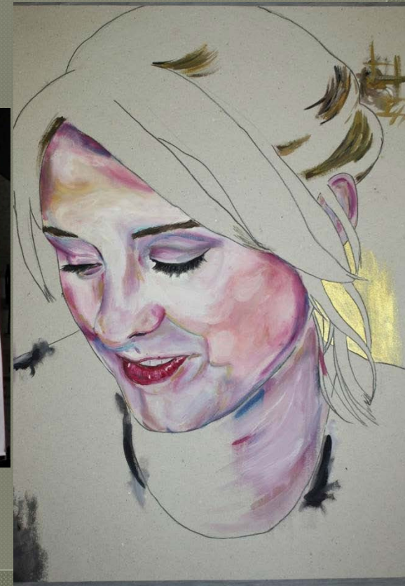
Examples of sketchbook layout and work