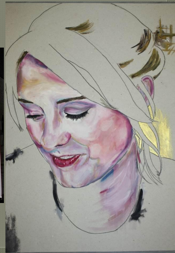
Examples of sketchbook layout and work